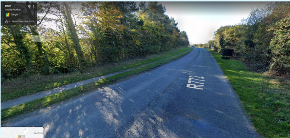
Figure 1 - Existing Footpath along the R772

Along the R-772 between M11 Junction 21 and the existing cycle and pedestrian facilities at the Knockmore Roundabout on the outskirts of Arklow town.