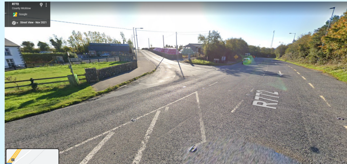
Figure 3 - Junction with L-2188